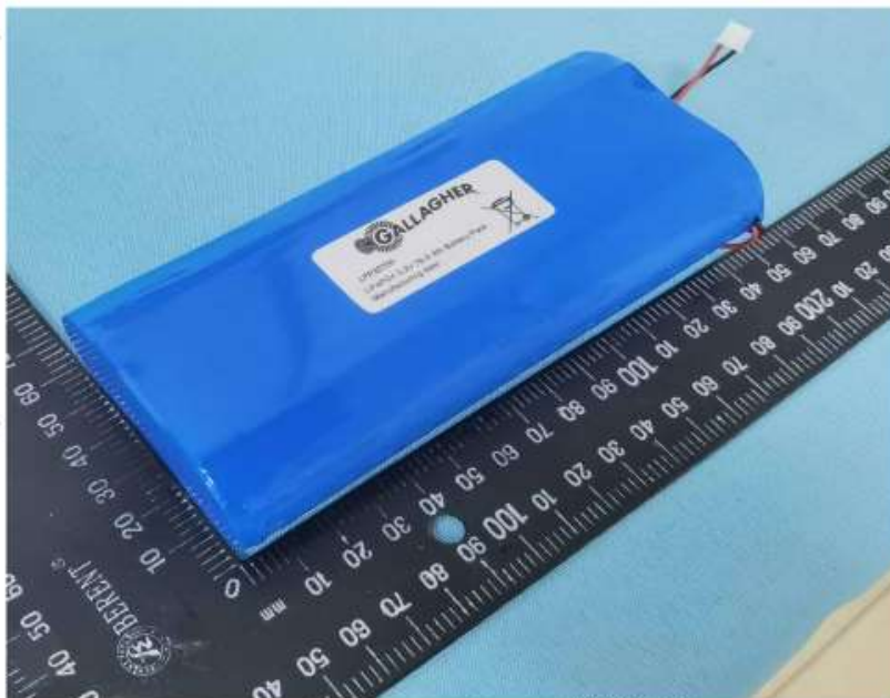
Figure 1 Overall view I of battery (电池外观图I)