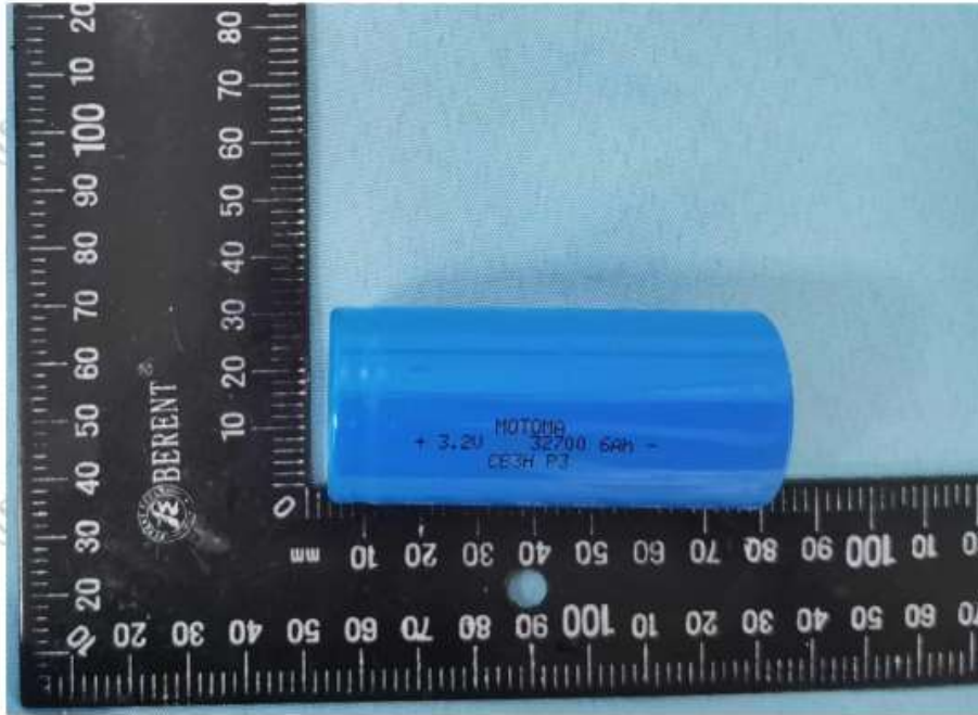
Figure 3 Overall view of cell (电芯外观图)