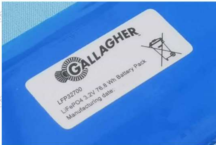
Figure 4 Overall view of label (标签图)