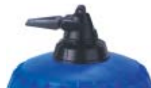
Integrated by-pass : system of turning concentrate injection on and off.

These options allow adapting your Dosatron to your needs. Contact our technical service to help determine what option you may need.