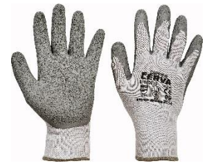
99 yellow-green | 00 grey